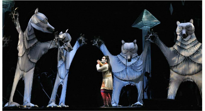
Jonas Kaufmann as Tamino in a scene from Act I of Mozart's "Die Zauberflöte."