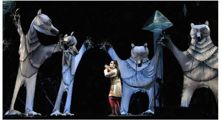
Jonas Kaufmann as Tamino in a scene from Act I of Mozart's "Die Zauberflöte."